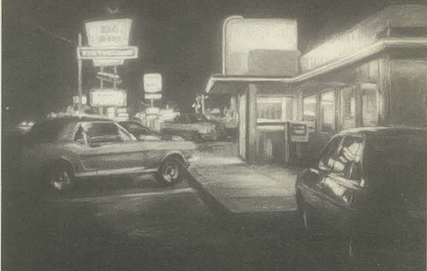
Nancy Popenoe, "The Old South," Pastel, 15" x 22"

AN INVITATIONAL GROUP SHOW FEATURING - AMONG MANY OTHERS: